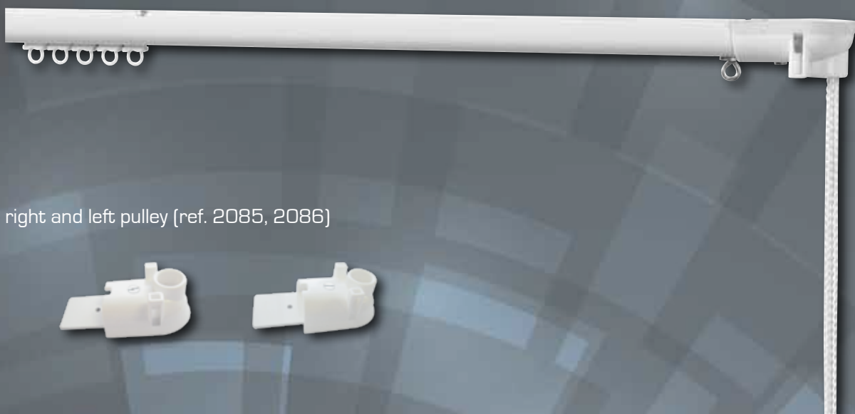
right and left pulley (ref. 2085, 2086)